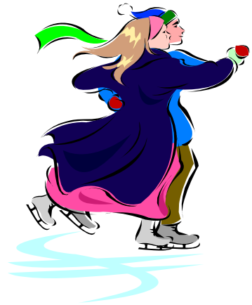
Skate on over to the Mt. Sterling Public Library for all your reading and viewing needs!