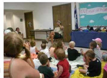
A full house for story time was not unusual for Summer Reading 2008

B possible. In the meantime, we will continue to be closed on Wednesdays and